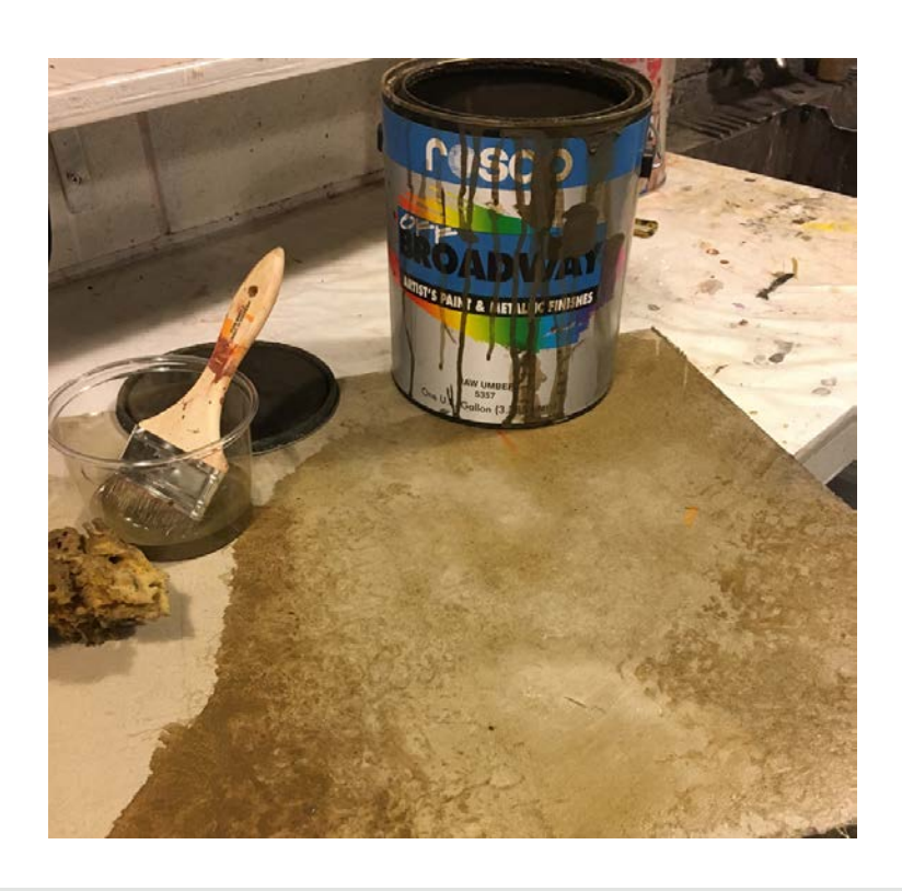
Pantone 448C – The World's Ugliest Color

While most people may be disgusted with this green/brown color, often called "Opaque Couché," we in the scenic art biz call it Raw Umber – and we are madly in love with it!